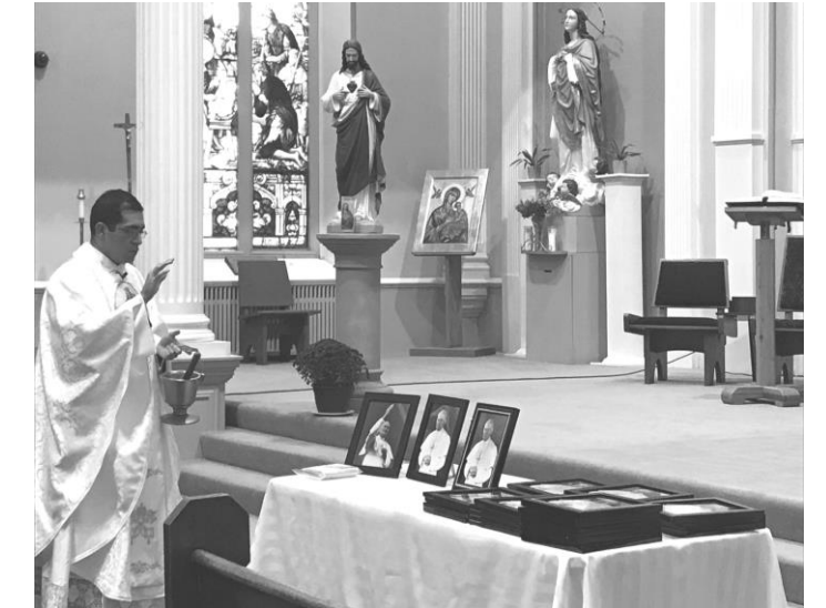
▲ distribution of St. John Paul II images at 5PM Holy Mass at Sacred Heart on Oct 22.

We thank all parishioners who are participating in praying for our Priests in the Diocese.